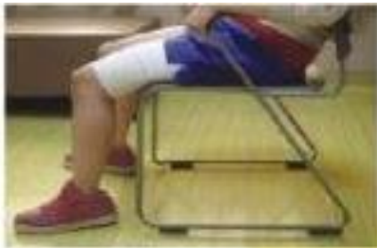
(Figure 5) Correct sitting position