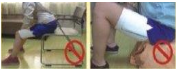
(Figure 6) Incorrect sitting poses

F. Do not sit in the low chair,lazyboy chair, rocking chair or sofa which is too soft.